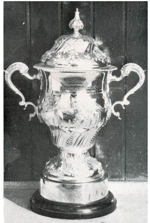
The Duke of Norfolk Challenge Cup, awarded to the Breed Society adjudged to have the best Group of pure-bred steers at the Royal Smithfield Show. Won in 1964 for the second successive year by a Galloway group.

THE BUTCHERS' COMPANY OF THE CITY OF LONDON'S SPECIAL CUP FOR THE CHAMPION BEEF CARCASE