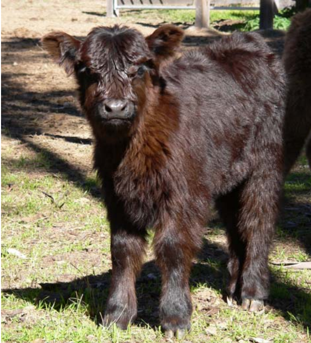
Heifer calf from 45 year old semen

“Galloway cattle are serious cattle for commercial cattle production”.